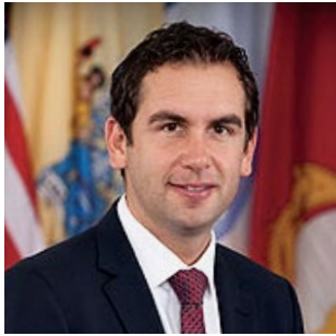
Steven Fulop Mayor, City of Jersey City

Steven Michael Fulop is the 49th and current Mayor of Jersey City, New Jersey — named in 2017 the second most diverse city in the nation and the soon-to-be largest city in New Jersey. Since Mayor Fulop took office in 2013, Jersey City residents have seen four consecutive years of stable taxes and four consecutive credit rating upgrades. Meanwhile, more than 300 new police officers have been hired, nearly 1,500 units of affordable housing built or approved, recreation expanded with nearly 30 new programs, and more than $6 million invested in parks and open space. During his time in office, Mayor Fulop has shown what smart, progressive leadership can accomplish.