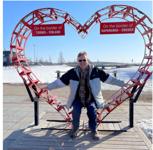
Photo Caption: [Translated] In addition to clean air, Sweden's open border delights and amazes foreign guests.