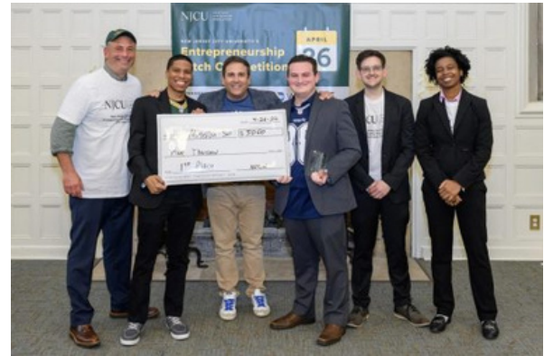
Photo Caption: The first-place prize for the competition was $5000. The winners moved on to a final round against three other colleges from Hudson County.