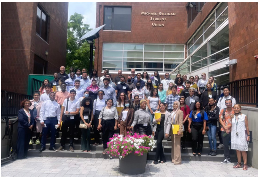
Photo Caption: Student interns, faculty mentors, support staff, and community partners at the 2022 Summer Research Internship Program Final Presentations.

NJCU's STEM departments provided more than 400 paid summer research internships over the past 20 years through U.S. Education Department Title III and Title V support. Students are drawn from NJCU's Biology, Chemistry, Computer Science, Earth Science, Finance, Mathematics, Nursing, Physics and Psychology Departments.