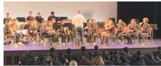
Photo Captions: Hudson County Alliance of Teen Artists, Performance Festival