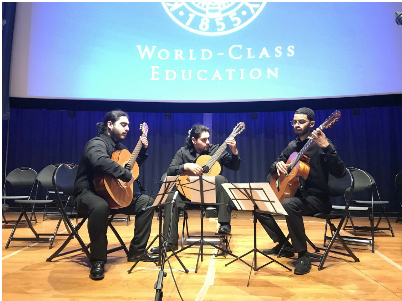
Photo Caption: Americas Guitar Trio from NJCU performs at the 1st Annual New Jersey Guitarfest @Kean University