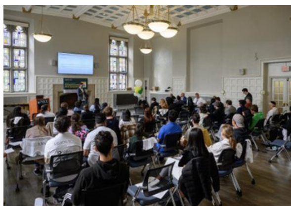
Photo Caption: The pitch competition took place on April 26 in the Gothic Lounge at NJCU.