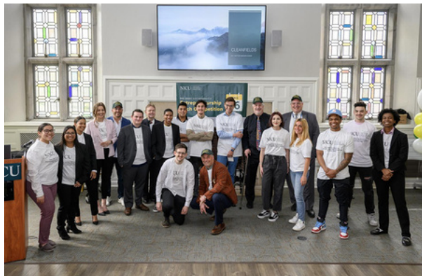
Photo Caption: The competition was sponsored by NJCU's Institute for Dispute Resolution (IDR), Mission 50, Valley Bank, and the LVE Group.