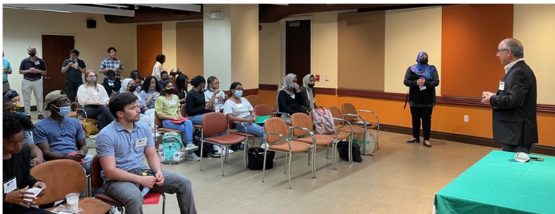
Photo Caption: 2022 Summer Research Internship Program Orientation