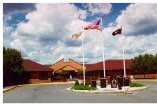
Memorial Home at Paramus 1 Veterans Drive, PO Box 608 Paramus, NJ 07653-0608 (201) 634-8525

The New Jersey Department of Military and Veterans Affairs manages three state-of-the-art long-term nursing facilities.