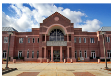
Memorial Home at Vineland 524 North West Blvd Vineland, NJ 08360-2895 (856) 405-4200