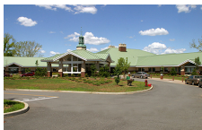
Memorial Home at Menlo Park 132 Evergreen Road, PO Box 3013 Edison, NJ 08818-3013 (732) 452-4102